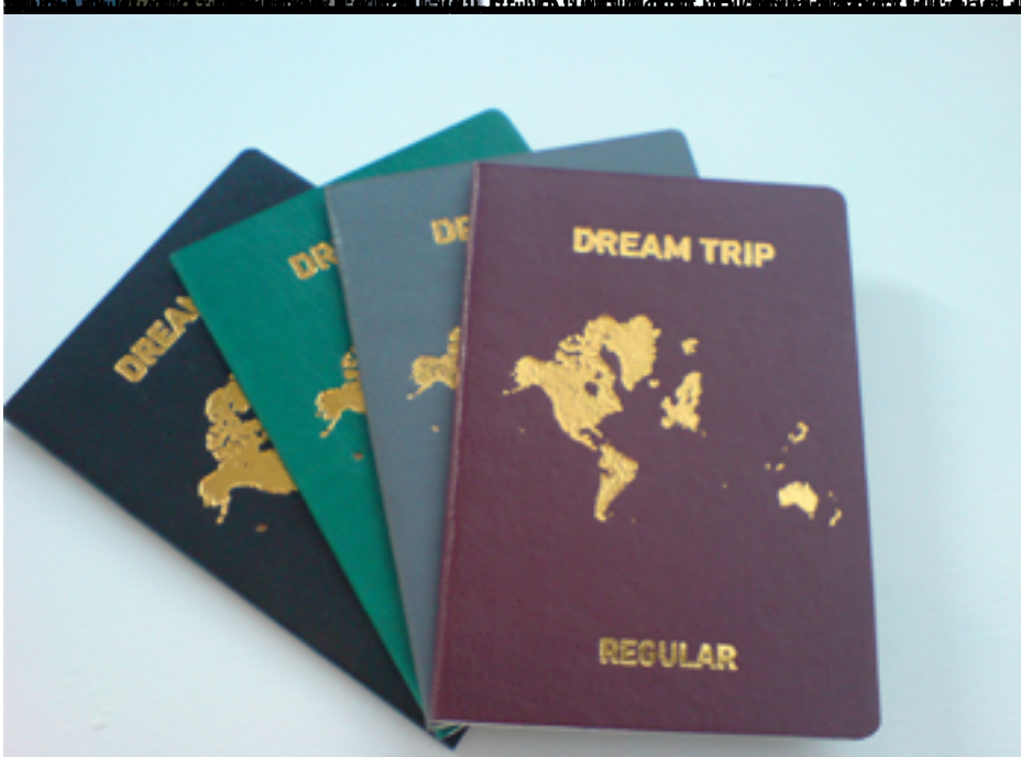
Castlefield Gallery , PiST// , Manchester triennial 2011